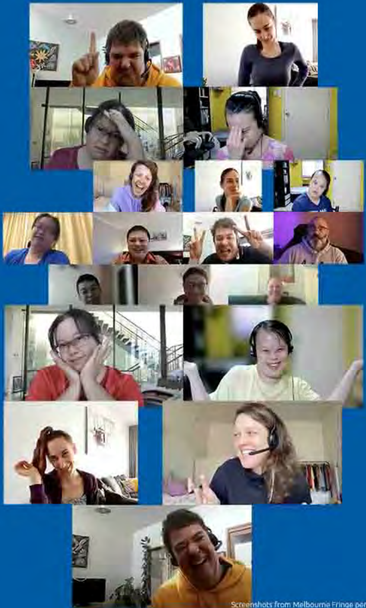
Screenshots from Melbourne Fringe performance