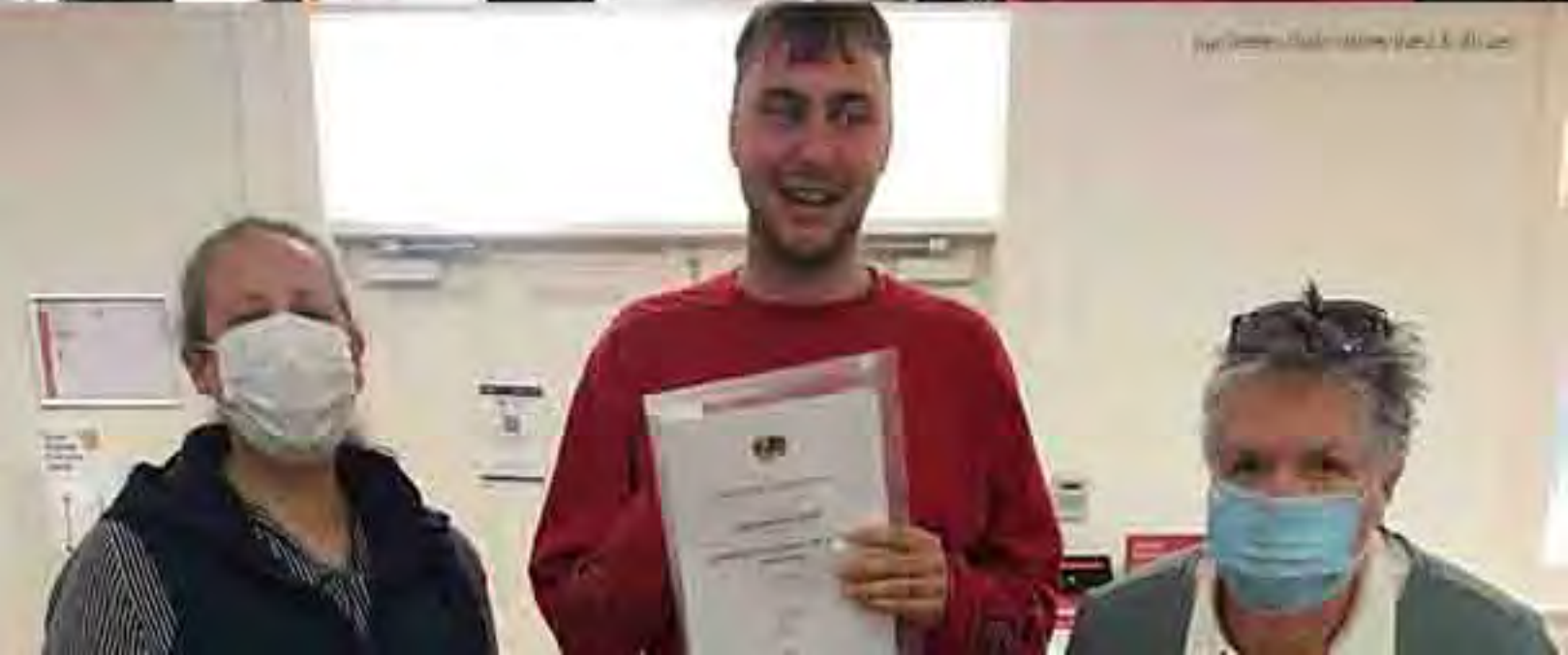
For more information, visit www.merfors.com